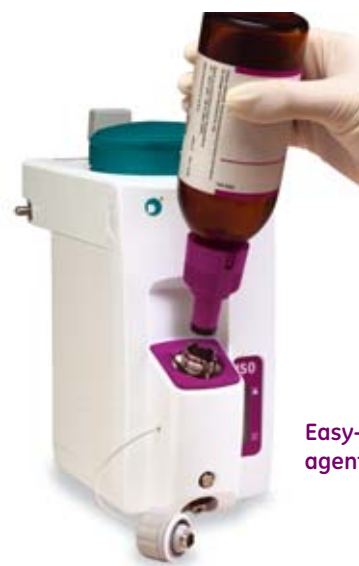
Easy-fil helps simplify agent filling