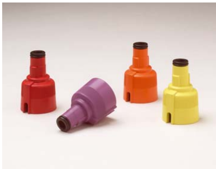
Agent color coded Easy-fill bottle adapters

Flowrate: Vaporizers are designed to provide consistent output throughout the clinical flow range from 200 mL/min to 15 L/min