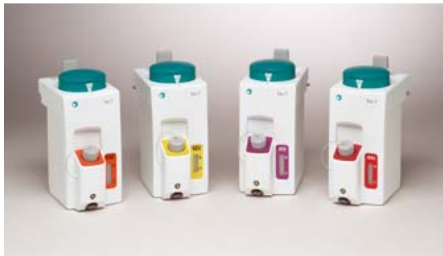
Tec 7 agent specific vaporizers