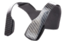
BRYGGA Shoulder Relief

Optionally, the the costume RA631 can be equipped with Outlast technology. The Outlast® inlay material absorbs heat specifically, stores and releases it again when needed.