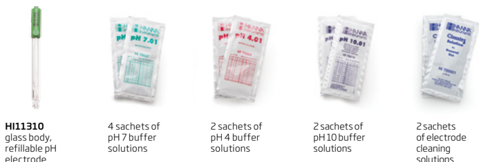
HI11310 glass body, refillable pH electrode

edge®pH: HI2002-01 (115V) and HI2002-02 (230V) also includes: