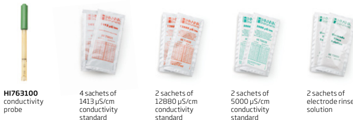
HI763100 conductivity probe

edge®EC: HI2003-01 (115V) and HI2003-02 (230V) also includes: