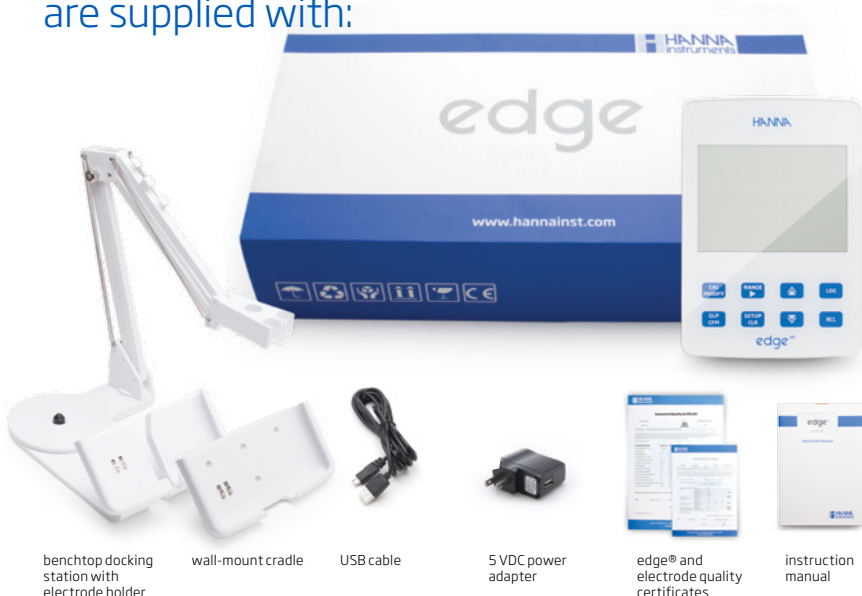
benchtop docking station with electrode holder

All edge® single parameter meters are supplied with: