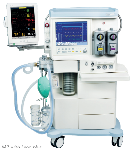
LM7 with Leon plus