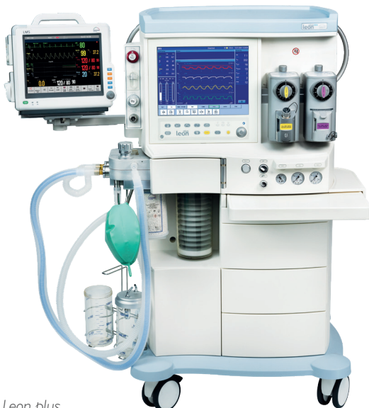
LM5 with Leon plus