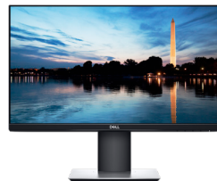
DELL 22 MONITOR - P2219H

23.8" ultrathin bezel optimized for dual display productivity. Easy Arrange feature enables multitasking efficiency and its small base frees valuable workspace.