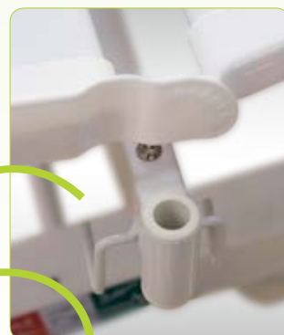
IV pole socket and dranige holes