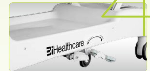
Fifth steering wheel, easy operation even one caregiver