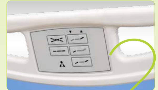
Embedded patient control panel, with auto-contour function