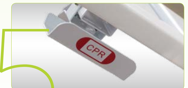
Manual CPR, just one push to be CPR position