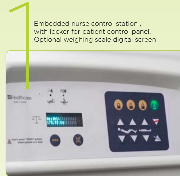
Embedded nurse control station , with locker for patient control panel. Optional weighing scale digital screen