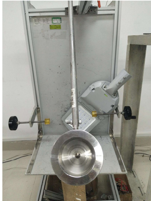
Figure 3 Photo of test