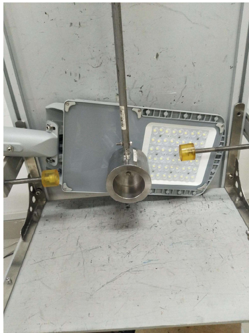
Figure 6 Photo of test