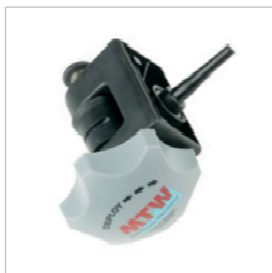
Handel with winding drum