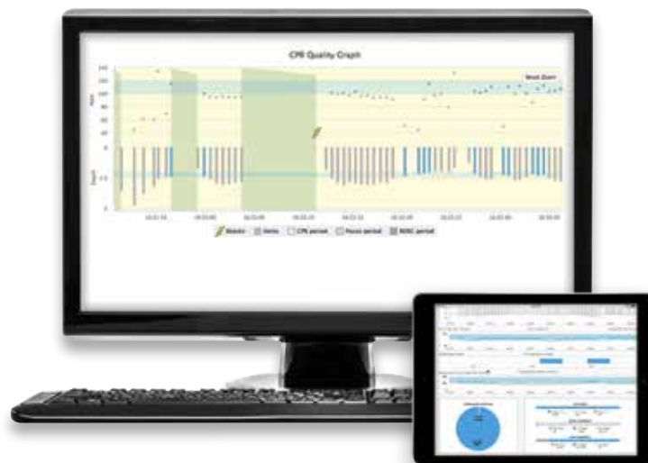
AutoPulse and X Series Advanced cases upload in aggregate to CaseReview