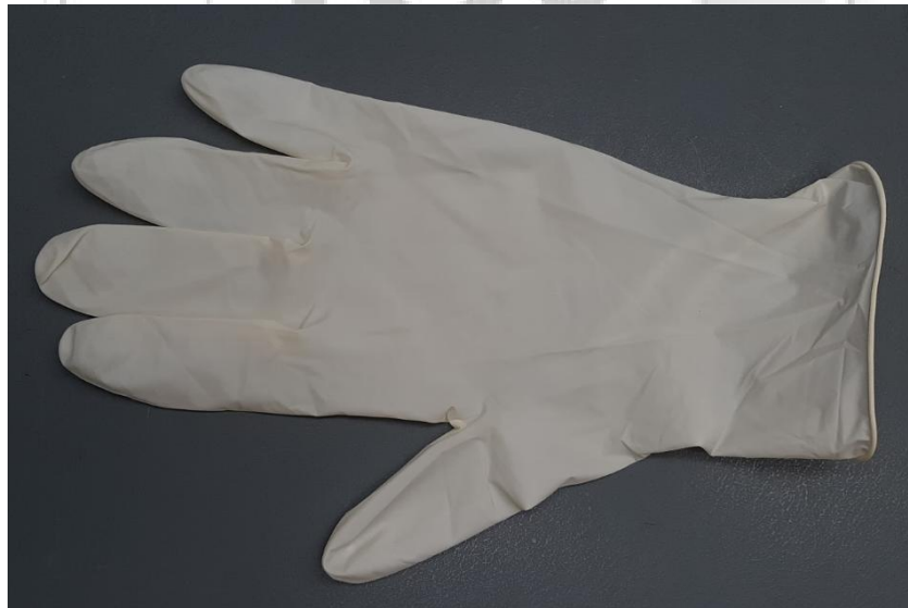
Photo: Latex Powder Free Online Chlorination Glove, Lot No. 013145956, Size M