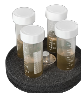
SV-4/30 BS-010210-AK platform