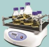
PSU-20i, Orbital Shaker