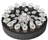
SV-16/8 BS-010210-CK platform

16/8/8 sockets for 2*- 1.5/0.5/0.2 ml microtest tubes (Ø 11/8/6 mm).