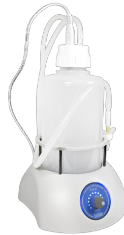
FTA-2i BS-040120-A02 Aspirator with Trap Flask

Aspirator with trap flask FTA-2i is designed for aspiration or removal of alcohol, buffer and liquid from reaction vessels (e.g. during DNA/RNA purification or other macromolecule reprecipitation techniques).