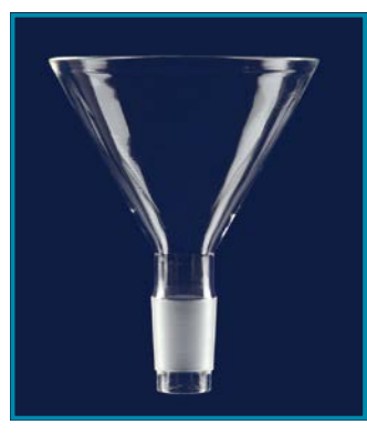
FUNNELS - "powder" - "P.P & glass"