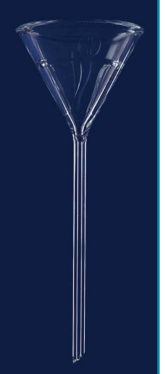
FUNNELS "glass" - "analitical"