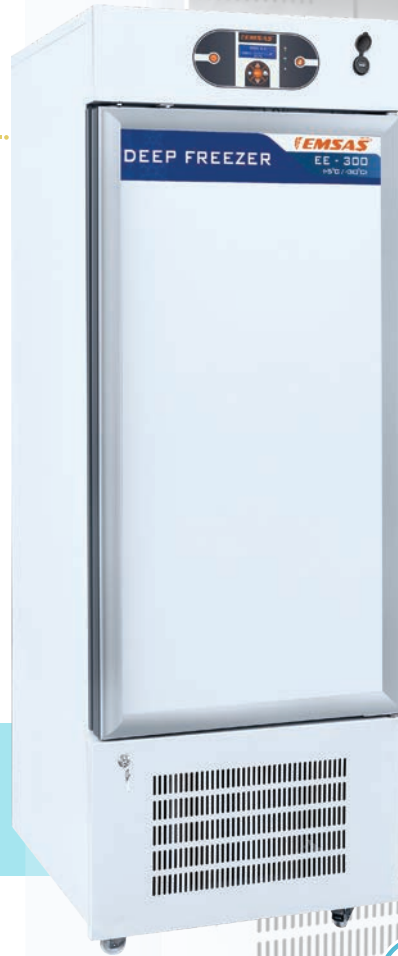
EE 300 (-5°C/-30°C)