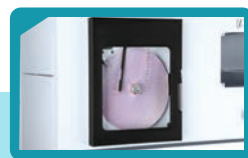
Optional Circular Printer