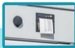
Optional Thermal Printer