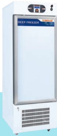
EE 150 (-5°C/-30°C)