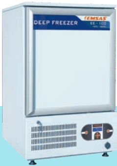
EE 100 (-5°C/-30°C)