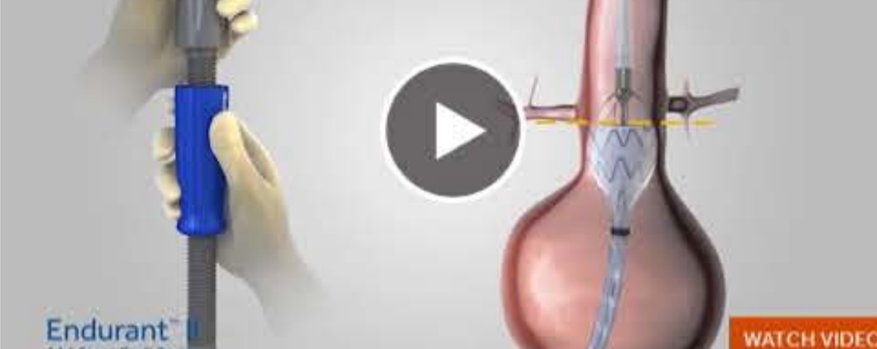
Deployment of the Endurant II Stent Graft - (03:05) View an animation of the Endurant II stent deployment.