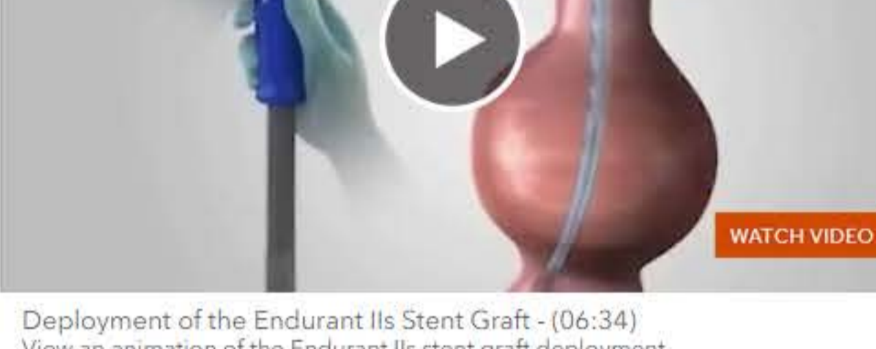
Deployment of the Endurant IIIS Stent Graft - (06:34) View an animation of the Endurant IIIS stent graft deployment.