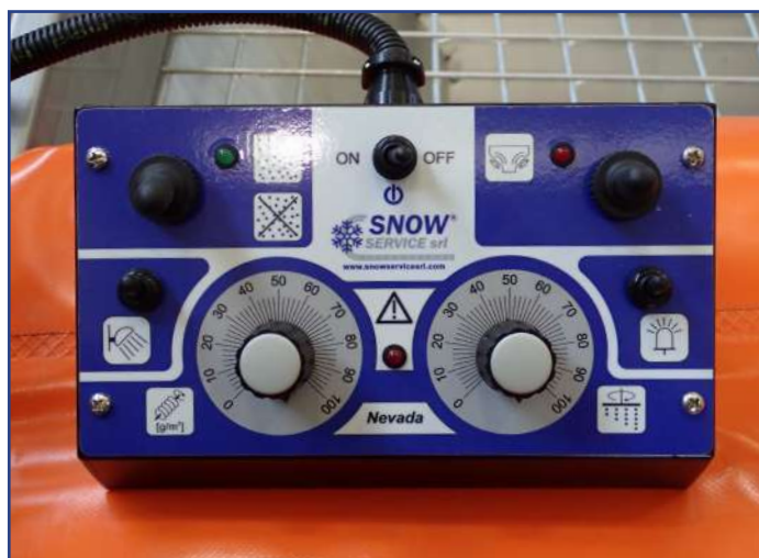
Electric push-button panel