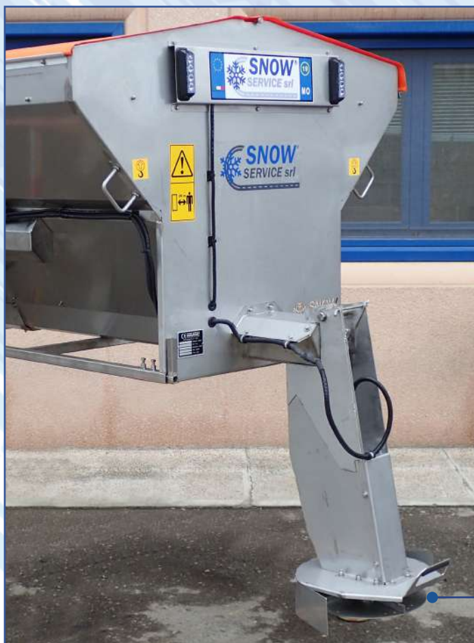
View of the Nevada salt spreader with the TOWER LIFTED UP