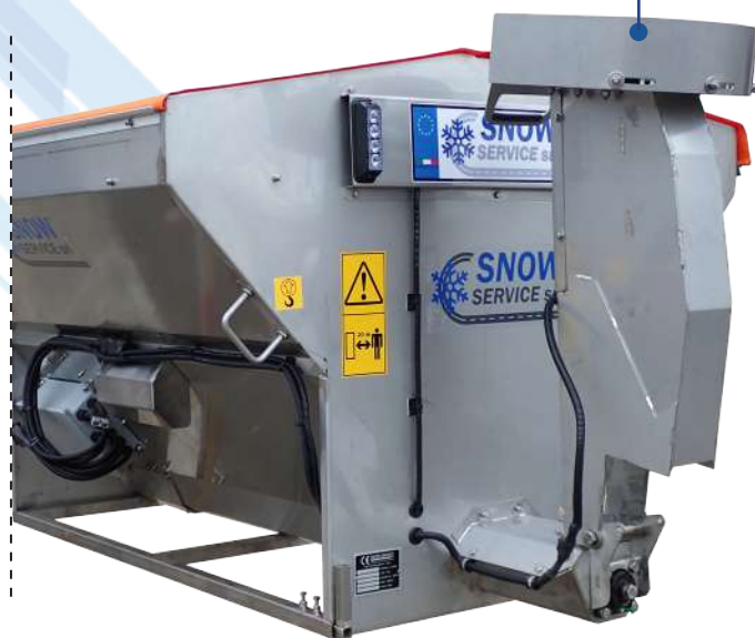
View of the Nevada salt spreader with the TOWER IN WORKING POSITION