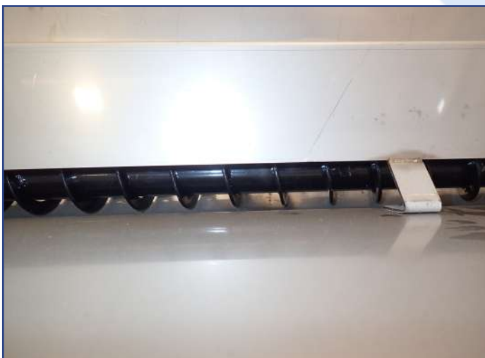
Steel spreading screw