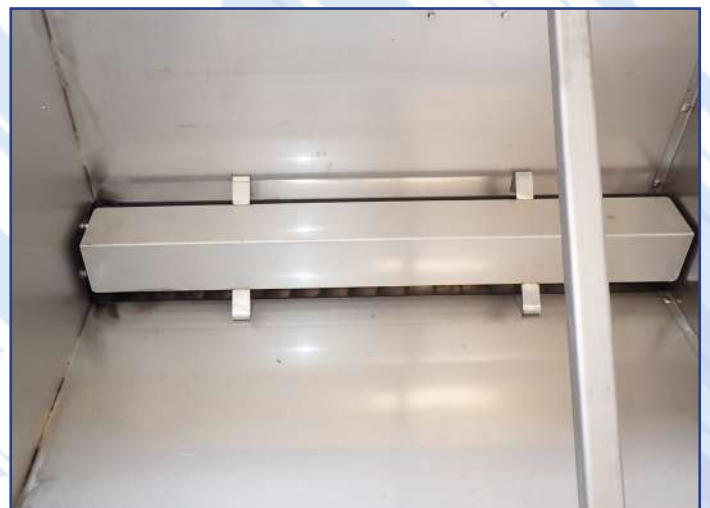
Steel support to protect the screw