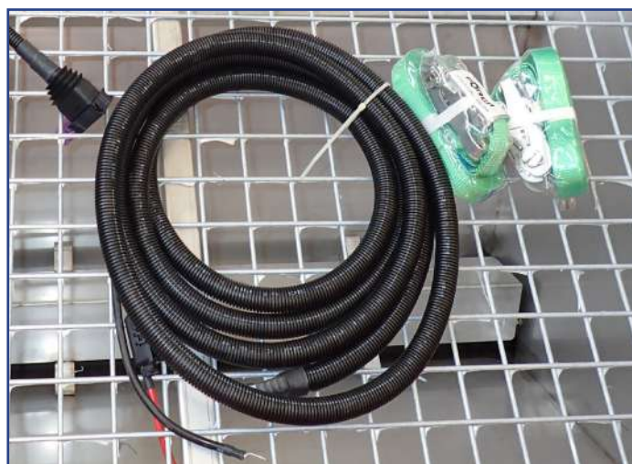
Battery cable connection kit and anchorage/fastening bands for fixing the salt spreader on the vehicle