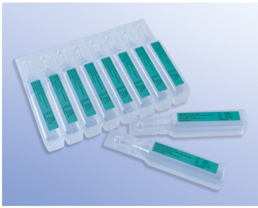
Irrigation Vials for OptiFlo