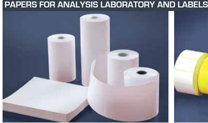
THE APPARENT SIMPLICITY OF PAPERS FOR INSTRUMENTS OF ANALYSIS HAS OFTEN INDUCED CONSUMERS TO BE EASILY SATISFIED TO THE DETRIMENT OF THE QUALITY OF THE REPORT AND, ESPECIALLY OF THE CONSERVATION OVER TIME OF THE DOCUMENTATION RELATING TO THE ANALYSIS.

A great priority must be given to the perfect running of the paper and to its excellent receptivity as for the writing pen. Through its paper Ceracarta constantly guarantees best results also in this sector, even during long recordings, thanks to its perfect adaptability, specifically and attentively researched, for all types of instruments.