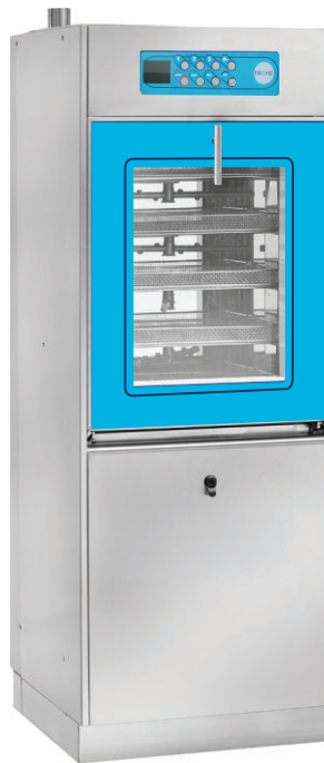
PROHS WD-10D (Manual Door)