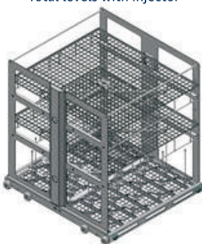
Laboratory washer trolley Mixed levels configuration