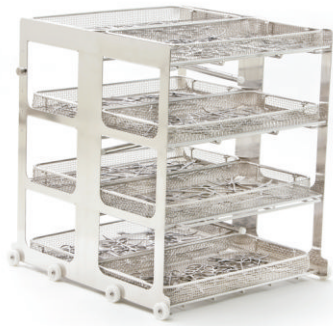
4 Levels washing trolley