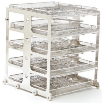
5 Levels washing trolley