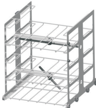
Baby bottles trolley