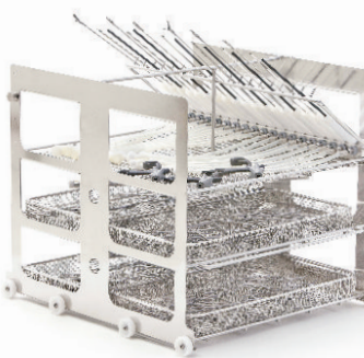
Mini invasive and tubular Surgery washer trolley