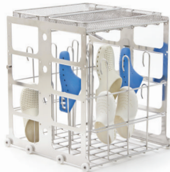
Shoes washer support structure