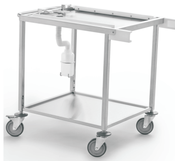
Load / unload trolley