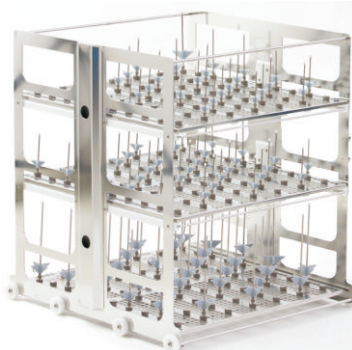
Laboratory washer trolley Total levels with injector