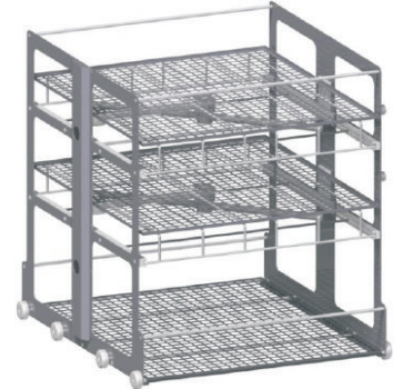
Glass washer trolley