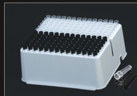
SP-11 to SP-15