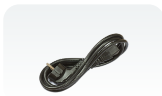
2 Power cords