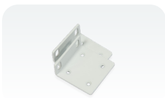
Rackmount bracket white