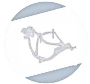
Reinforced Polycarbonate Frame