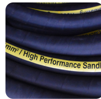
Sandblasting hoses Extension