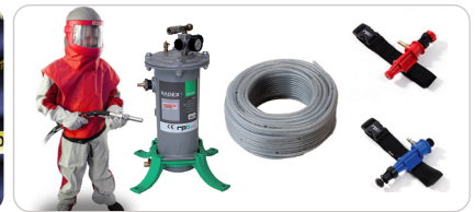
Protective equipment and accessories

Sapi Sandstrahl und Anlagenbau GmbH Enkinger Weg 4 86753 Möttingen Deutschland