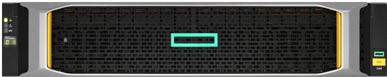
HPE MSA 2060 Storage

The HPE MSA 2060 is a flash-ready hybrid storage system designed to deliver hands-free, affordable application acceleration for small and remote office deployments. Don't let the low cost fool you. It gives you the combination of simplicity, flexibility, and advanced features you may not expect in an entry-priced array. Start small and scale as needed with any combination of solid state drives (SSDs), high-performance Enterprise SAS HDDs, or lower-cost Midline SAS HDDs. With the ability to deliver 325,000 IOPS, the new MSA 2060 is up to 45% faster than its prior generation with ample horsepower for even the most demanding workloads.