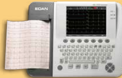
SE-1200 Express Electrocardiograph