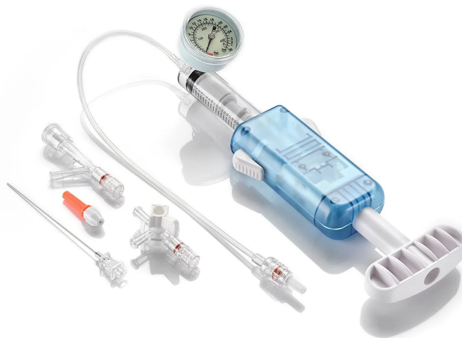
Balloon Inflation Device BID1 Type