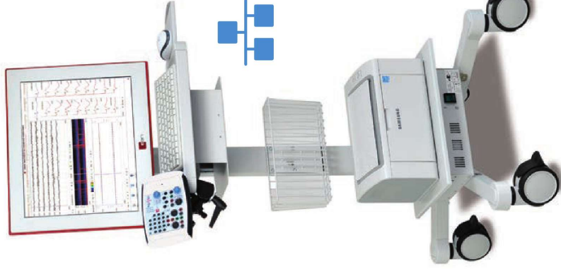
NeMus 2 - 700 with trolley