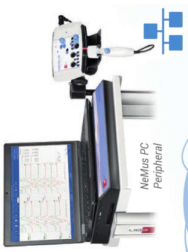
NeMus PC Peripheral