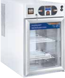
EKT 80 (2/8)