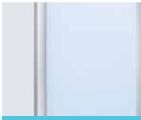
OPTIONAL BLOCK 3XGLASS DOOR