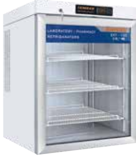
EKT 150 (2/8)