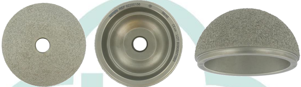
FIG. 1: EcoFit® NH CUP

The EcoFit® Cup is a hemi-spherical, 2-piece modular metal shell / polyethylene- or ceramic- insert acetabular cup. The metal shells are manufactured from wrought TiAl 6 V 4 alloy acc. to ISO 5832-3 in 12 outer diameter sizes from 46 mm – 68 mm.