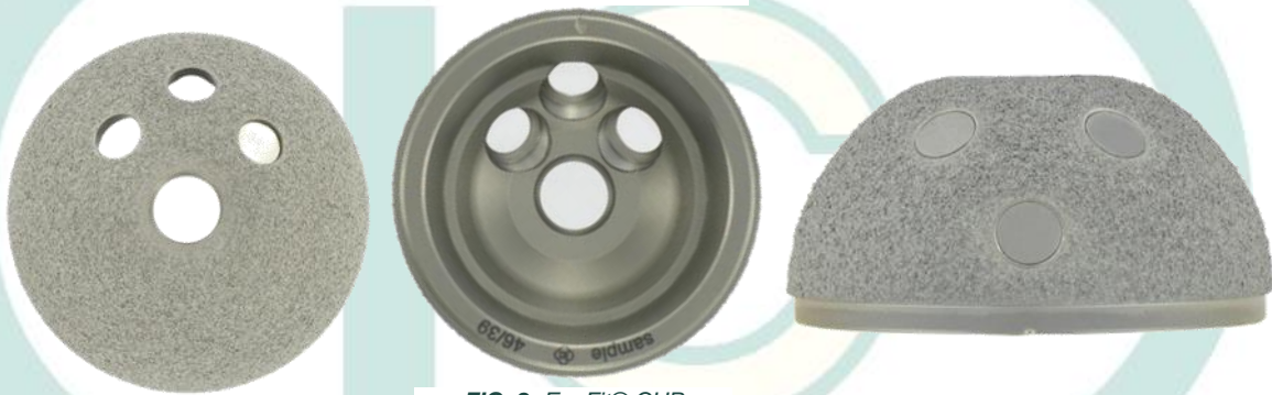
FIG. 2: EcoFit® CUP

The metal shell is available in two (2) versions: one with a cluster of three (3) 6.6 mm diameter peripheral holes for placement of 6.5 mm diameter flat head adjunctive bone screws for adjunctive fixation as needed and a version with no peripheral screw holes (designated as the “NH” version with “NH” representing “No Holes”). Both versions have a 10 mm diameter threaded apex hole for attachment of the cup shell insertion instrument. A threaded 10 mm diameter apex hole plug is provided to eliminate the apex hole after insertion of the shell and 6.5 mm diameter bone screw hole plugs are available to fill any screw holes that are not used for bone screws in the shell that has peripheral screw holes). The optional 6.5 mm diameter bone screws for adjunctive fixation are provided in lengths from 15 mm to 55 mm in 5 mm increments. The metal shells, apex hole plug, bone screw hole plugs, and bone screws hole plugs are manufactured from TiAl 6 V 4 alloy acc. to ISO 5832-3.