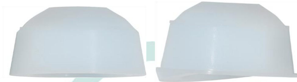
FIG. 4: PE INSERT 0° (LEFT), 10° (RIGHT)

The PE inserts are available in a standard profile configuration (0°, no lateral overhang) and a 10° lateral lip version to provide greater coverage of the femoral head to help prevent dislocation in cases at greater risk of dislocation, such as hip dysplasia.