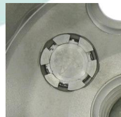
FIG. 3: SCREW HOLE

The metal shell is available in two (2) versions: one with a cluster of three (3) 6.6 mm diameter peripheral holes for placement of 6.5 mm diameter flat head adjunctive bone screws for adjunctive fixation as needed and a version with no peripheral screw holes (designated as the “NH” version with “NH” representing “No Holes”). Both versions have a 10 mm diameter threaded apex hole for attachment of the cup shell insertion instrument. A threaded 10 mm diameter apex hole plug is provided to eliminate the apex hole after insertion of the shell and 6.5 mm diameter bone screw hole plugs are available to fill any screw holes that are not used for bone screws in the shell that has peripheral screw holes). The optional 6.5 mm diameter bone screws for adjunctive fixation are provided in lengths from 15 mm to 55 mm in 5 mm increments. The metal shells, apex hole plug, bone screw hole plugs, and bone screws hole plugs are manufactured from TiAl 6 V 4 alloy acc. to ISO 5832-3.