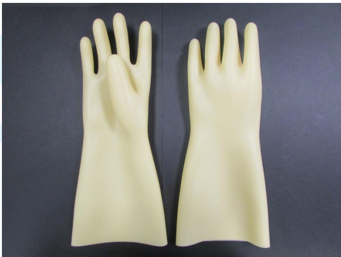
Gloves described as Insulating gloves