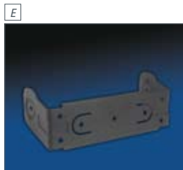
Trunion Mounting Brackets