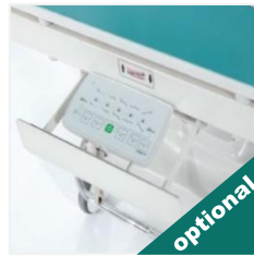
Nurse Panel Shelf