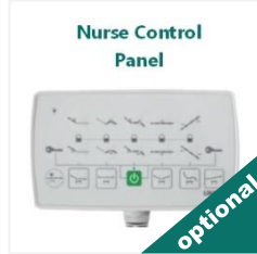
Foot-end Nurse Control Panel