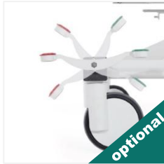
Central Brake Castors 150 mm