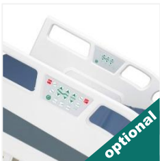
Control Panels Embedded on Side Rails