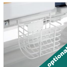
Urine Bag Basket