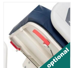
Dual Sided Manual CPR at Backrest