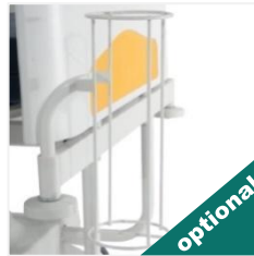
Oxygen Cylinder Holder