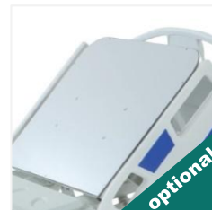
X-Ray Translucent Backrest with Cassette Holder