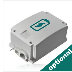
Rechargeable Battery Backup