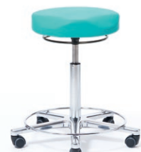
WORK STOOL 54 - 73 cm. Item code 4109105 Chromed foot ring, anatomically shaped seat edge Ø 40 cm, cover in compact „Cyan“ C422, 360° manual ring release, safety castors.