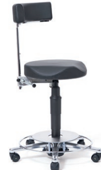
WORK CHAIR 51 - 71 cm. Item code 4185305 EL 11 Foot release, swivelling crescent-shaped backrest height adjustable, anatomically shaped seat edge Ø 40 cm, cover „Black“ EL 11, gas spring column and safety castors overall electrically conductive.