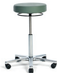
WORK STOOL 54 - 73 cm. Item code 3008305 5-star base polished, sitting cushion Ø 36 cm, cover in compact „Petrol“ C435, 360° manual ring release, safety castors.

Let us offer you some inspiration: Here is a small selection from the GREINER work stools and chairs' product range. Stools without backrest, chairs with backrest in different designs. Height adjustment by hand or foot. Base parts and sitting heights of your choice. Upholstery materials in a wide variety of colours with compact or premium fabric. Or EL 11 equipment that is suitable for surgeries with electrically conductive components. The choice is yours.