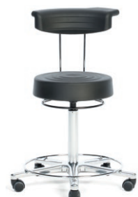
WORK CHAIR 54 - 73 cm. Item code 4019105 Chromed foot ring, full foam sitting cushion and crescent-shaped backrest, „Black“, 360° manual ring release, safety castors.