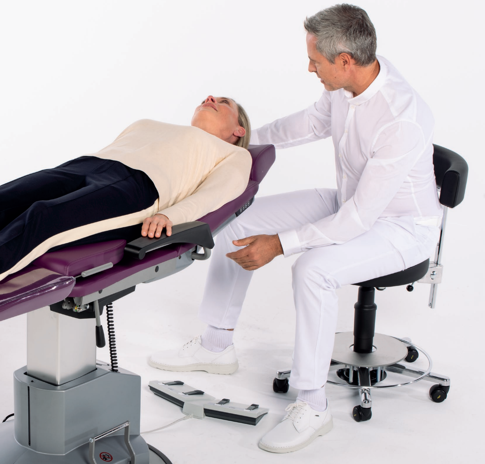
The examples shown here represent just a small selection out of the broad variety.

Let us offer you some inspiration: Here is a small selection from the GREINER work stools and chairs' product range. Stools without backrest, chairs with backrest in different designs. Height adjustment by hand or foot. Base parts and sitting heights of your choice. Upholstery materials in a wide variety of colours with compact or premium fabric. Or EL 11 equipment that is suitable for surgeries with electrically conductive components. The choice is yours.