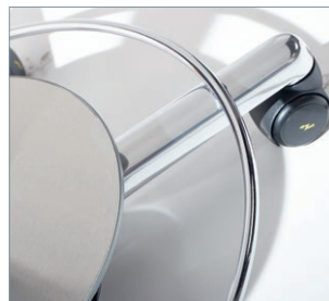
Foot release with foot ring