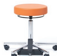
WORK STOOL 46 - 58 cm. Item code 3008205 CENTRAL 5-star base polished with central arrest, sitting cushion Ø 36 cm, cover in compact „Orange“ C530, 360° manual ring release.