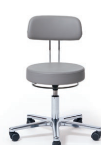
WORK CHAIR 40 - 52 cm. Item code 3018105 5-star base polished, small backrest height adjustable, sitting cushion Ø 36 cm, cover in compact „Stone“ C214, 360° manual ring release, safety castors.