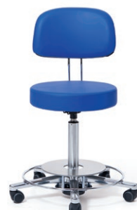
WORK CHAIR 51 - 71 cm. Item code 4155305 Foot release, full foam sitting cushion and crescent-shaped backrest, adjustable, sitting cushion Ø 40 cm, cover in compact „Atoll“ C706, safety castors.