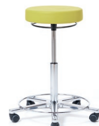
WORK STOOL 54 - 73 cm. Item code 3009105 Chromed foot ring, sitting cushion Ø 36 cm, cover in compact „Citron“ C500, 360° manual ring release, safety castors.