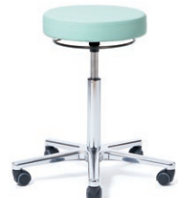
WORK STOOL 54 - 73 cm. Item code 3008305 5-star base polished, sitting cushion Ø 36 cm, cover in compact „Mint“ C450, 360° manual ring release, safety castors.