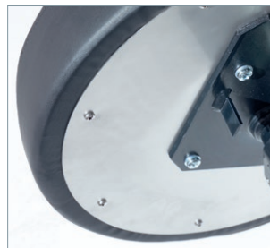
Stainless steel round plate