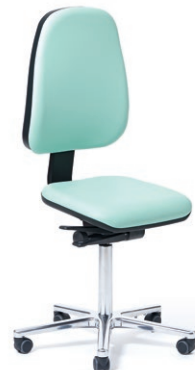
OFFICE CHAIR 54 - 73 cm. Item code 3054600 5-star base polished, backrest adjustable in height and depth with dumping function, without armrest, cover in compact „Mint“ C450, safety castors.