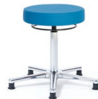
WORK STOOL 54 - 73 cm. Item code 4108305 RG 01 PREMIUM HO 5-star base polished with sliders, sitting cushion Ø 40 cm, cover in premium „Aqua“ P700, 360° manual ring release.