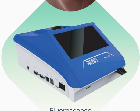
Fluorescence Immunoassay Analyzer