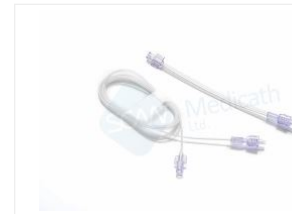
Normal Connecting Tubing