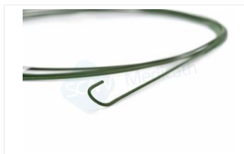
PTFE Coating Guide Wires