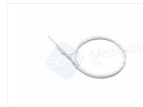
Stainless Steel Guide Wire