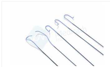
Radiology Angiographic Catheter