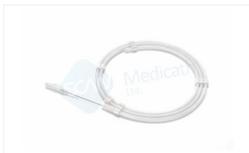
PTCA Balloon Catheter