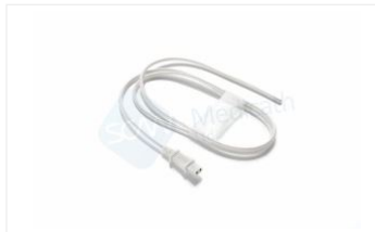
General Purpose Temperature Monitoring Probe