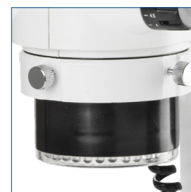
● Built-in LED ring light SB.3903