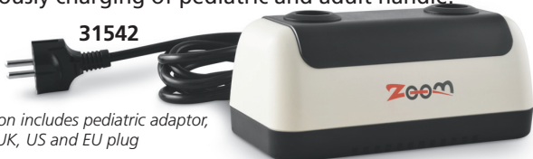
Charging station includes pediatric adaptor, wall support, UK, US and EU plug

• 31542 GIMA GREEN CHARGING STATION - 100/200 V - 50/60 Hz It can charge either 2.5 V / 3.5 V NiCa, NimH or Li-ion rechargeable batteries independently of their status of charge. Unit is designed to prevent over charging of batteries. Simultaneously charging of pediatric and adult handle.