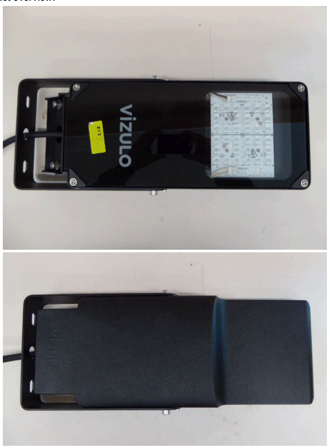
Figs. 1 and 2 – Front side and top side of Micro Martin street lighting luminaire