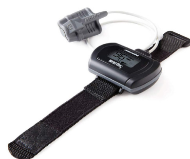
Nonin® Wrist Ox2 3150 pulse oximeter for SpO2 integration

Multiple printout report formats (single lead, all leads, full disclosure, sum up, trends, QRS, etc.)