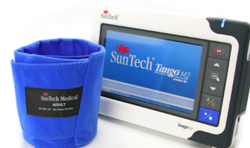
Suntech Tango® blood pressure monitor allows to integrate several parameters, including SpO2