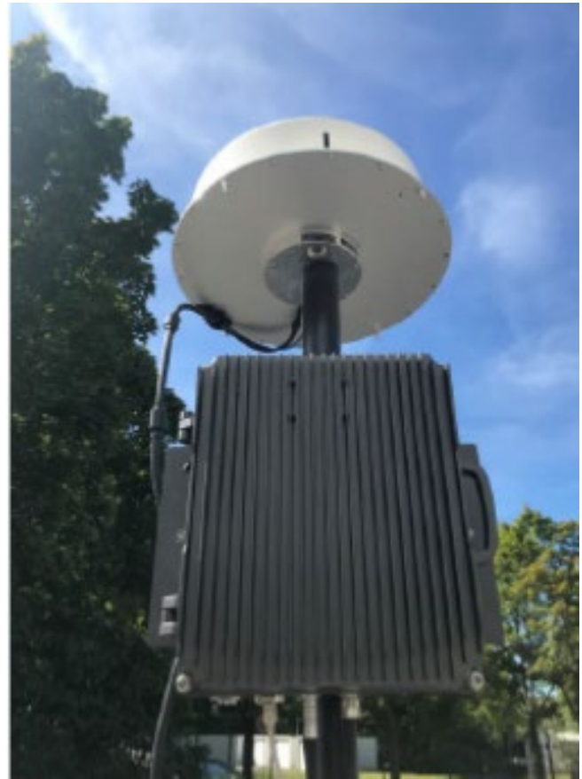
Fig. 1. The SignalShark Outdoor Unit and Automatic DF antenna for AoA and TDOA.

Different versions of the "SignalShark Outdoor Unit Modem" are available depending on the region in which the device is to be used, taking into account the respective mobile radio frequency range. Your local Narda sales representative will be happy to assist you in the selection of the right version.