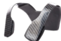
BRYGGA Shoulder Relief

Optionally, the costume RA631 can be equipped with Outlast technology. The Outlast® inlay material absorbs heat specifically, stores and releases it again when needed.