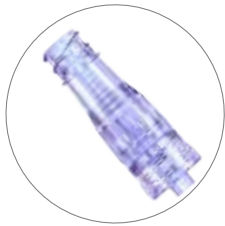
Needle free connector Optional