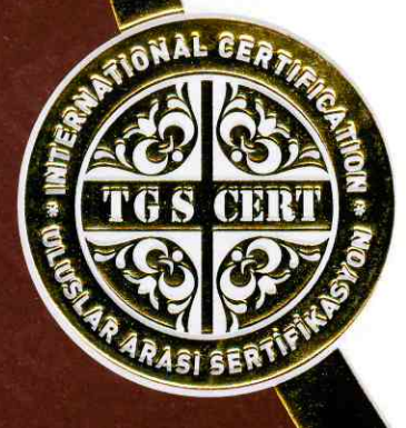
TGS International Certification