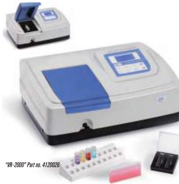
"VR-2000" Part no. 4120026