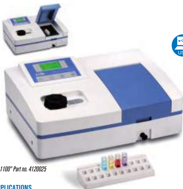
"V-1100" Part no. 4120025

"VR-2000" MODEL WITH AUTOMATIC WAVELENGTH SETTINGS AND BLANK.