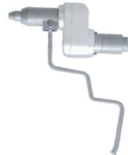
NM5-6001 K Wire Adapter