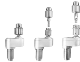
NM5-2001 Canulate Drill Adapter

Multiple functions in one, wide range of applications. Quick replacement of adapters, convenient and speedy. Suitable for joint, trauma, neurosurgery, and intracardiac surgery; Applicable components consist of canulate drill adapter, K wire adapter, bone drill adapter, acetabular reaming drill adapter, oscillating saw adapter, cranial drill adapter, reciprocating saw adapter, sternum saw adapter, TPLO saw adapter and cranial mill adapter.