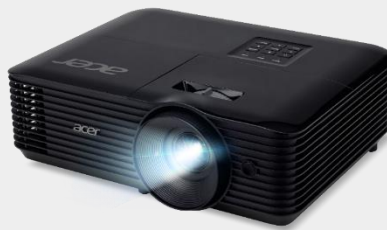
4,500 Lumens SVGA Projector X1128HK