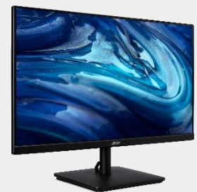
24" ZeroFrame FHD Monitor VA2 series