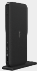
Acer USB Type-C Dock III