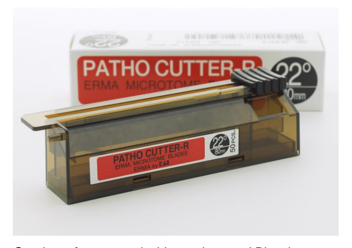
Good use for extremely thin sections and Biopsies.