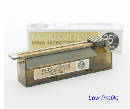
Good for cryostat and rotary microtomes as well as sledge microtomes.