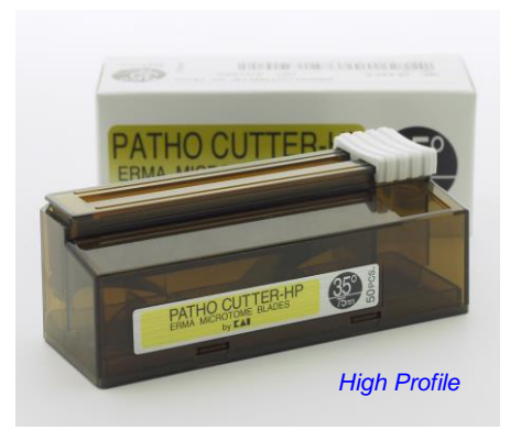
Suitable for slicing hard tissue and frozen samples.