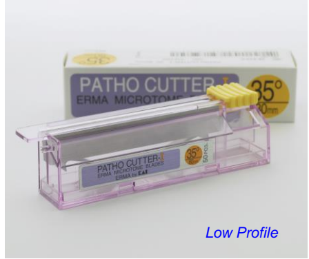
Routine applications with consistent edge sharpness.