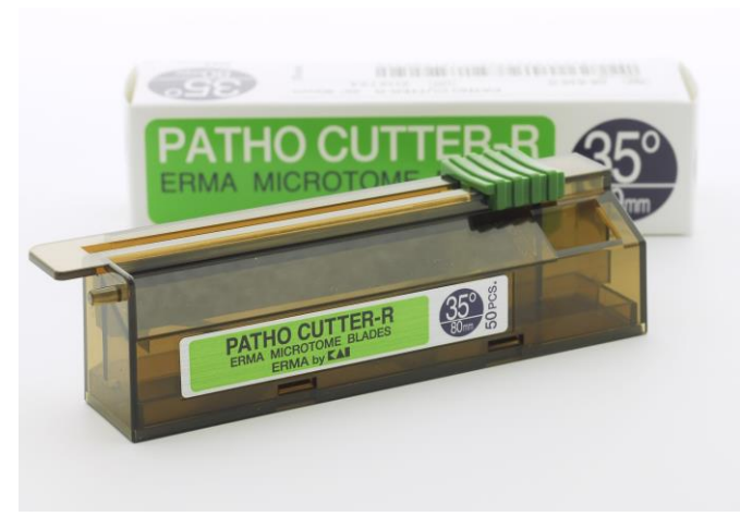
Especially recommended for rotary microtomes.