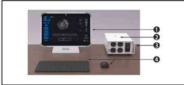
1 Tablet in Desktop Docking Station, 2 System Identification Label, 3 Isolation Station power button, 4 Keyboard and Mouse are installed in the control room adjacent to the procedure room.

The Integrated System is customized for the clinical environment where it is used. In a typical integrated configuration, the system components, are shown.