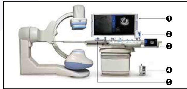
1 Secondary Display, 2 FFR Link, 3 Tableside Control, 4 Acquisition Processor located either behind the monitor or on the floor, 5 Motor drive unit.

Tableside Control, compatible resolution of 1920 px X 1080 px, is a rail-mounted touchscreen display that allows for interaction with the system at the bedside to improve the overall procedural workflow.