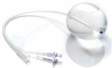
Obstetrics & Gynecology Products