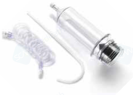
Medical Imaging Products