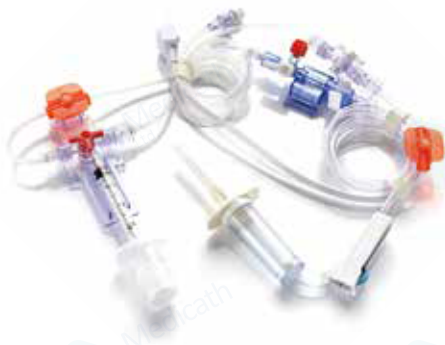
Anesthesiology & Critical Care Products