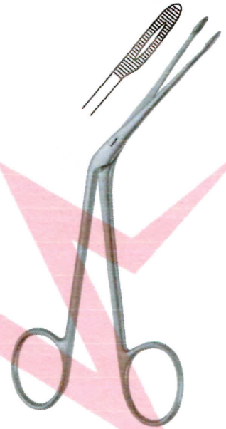
Hartmann 160 mm - 6 1/4" | NF 15-20-01 200 mm - 8" | NF 15-20-02