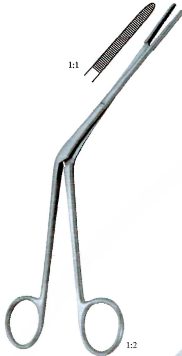
Westmacott 200 mm - 8" | NF 15-10-01

Nasenpolypenzangen - Septumzangen : Nasal polypus and septum forceps Pinces à polypes et la cloison nasale : Pinzas para pólipos y el tabique nasal Pinze per polipi e setto nasale